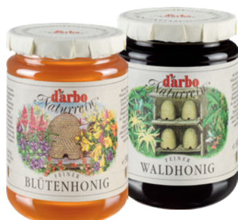
Austrian product packaging

This honey in its handy 250 g jar is ideal for small households. You can choose between a mild summer blossom honey and a tangy mix of forest and blossom honey. Depending on your preference, both honeys can be perfect on fresh bread, in muesli, in a dessert or as a sweetener for your tea.