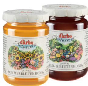
Austrian product packaging